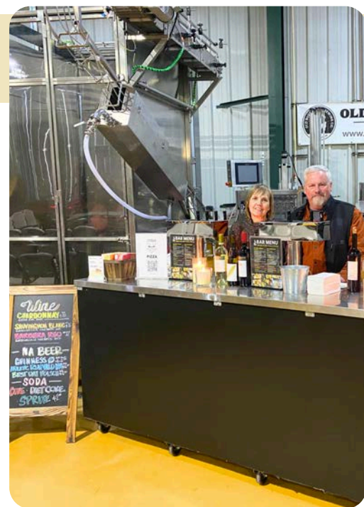
8 Tap bar In room with custom chalkboard