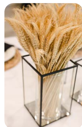
Natural dried wheat bundle with lantern style vase