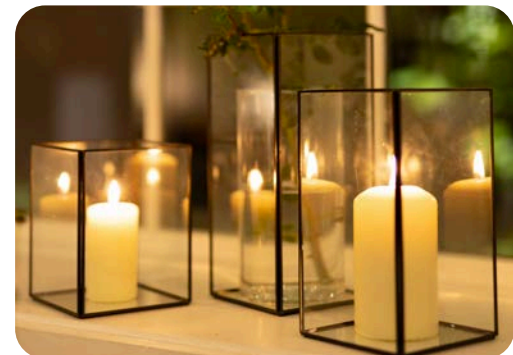
Set of three glass lanterns with candles